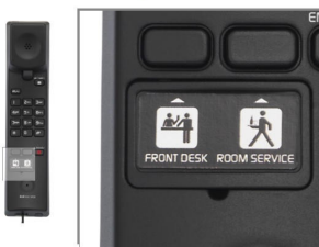
Handset Faceplate / Icons