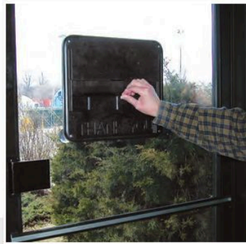
Lever on back slides to change sign.

Sign includes polyethylene signs, 8 sign faces, 4 suction cups, and 3/4" white Helvetica character set. Sign comes blank to choose insert option.