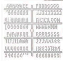
Open/Closed sign already installed in board. This set includes 4 suction cups and 3/4" white Helvetica character set.