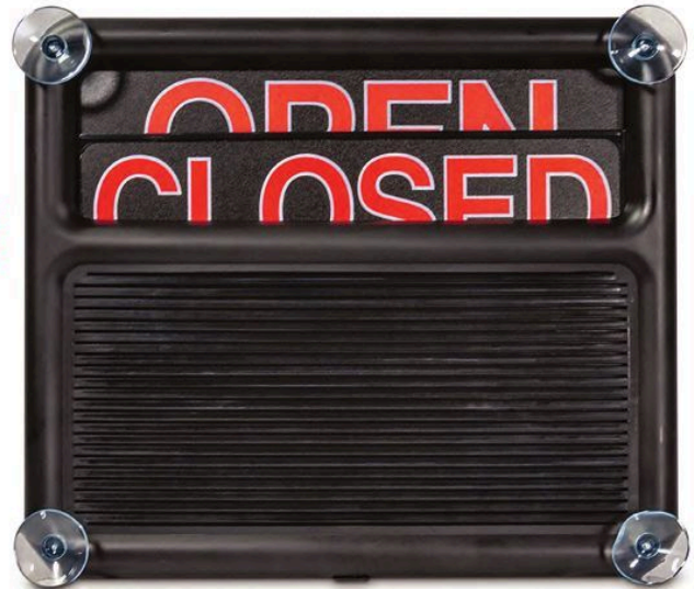
Simply slide sign from "open" to "closed"