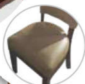
Top stitch POS Available