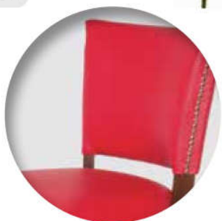
POB w/ DN