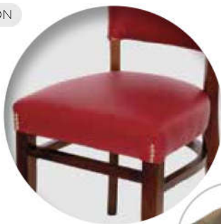
POS w/ DN